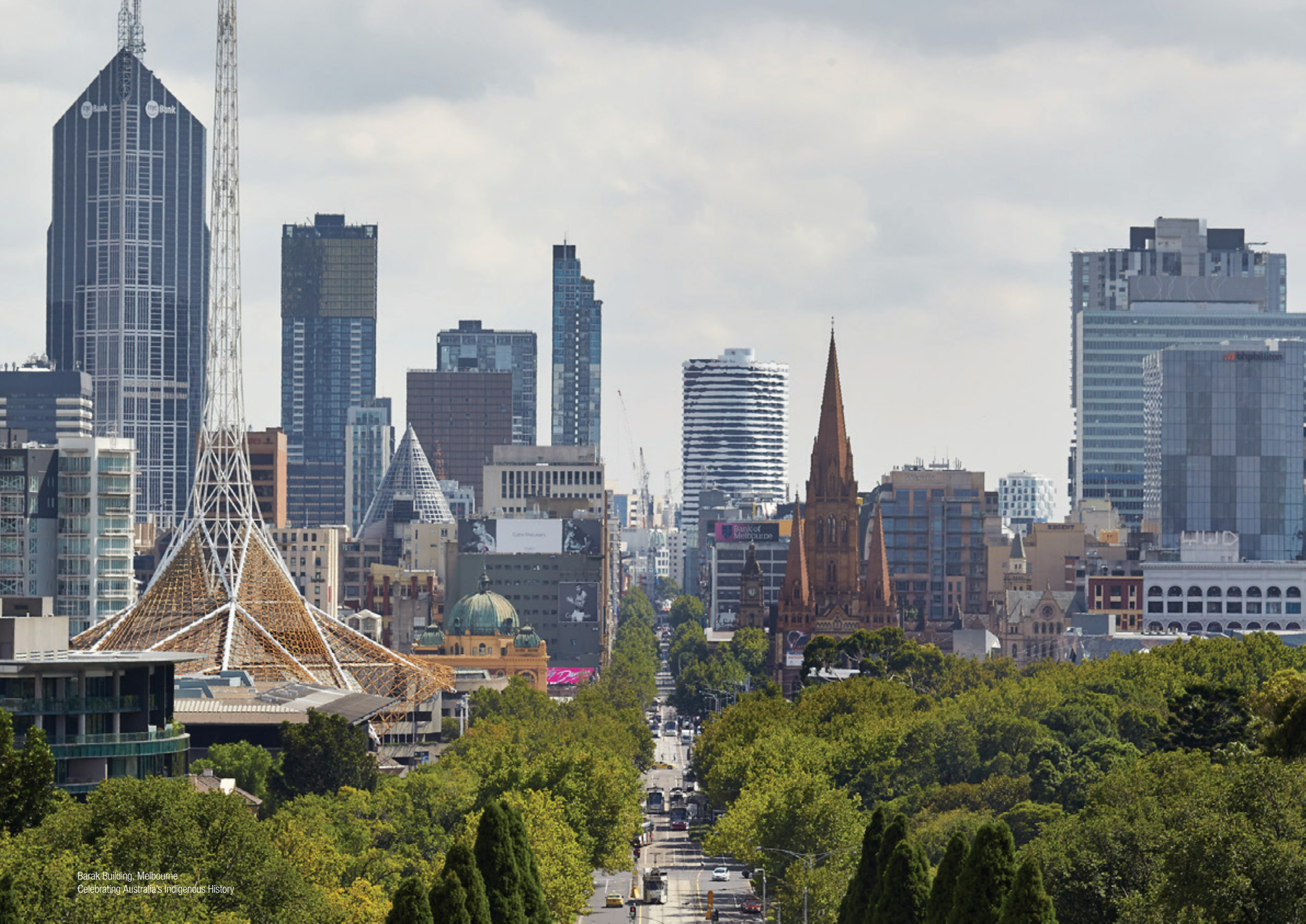
Barak Building, Melbourne Celebrating Australia's Indigenous History