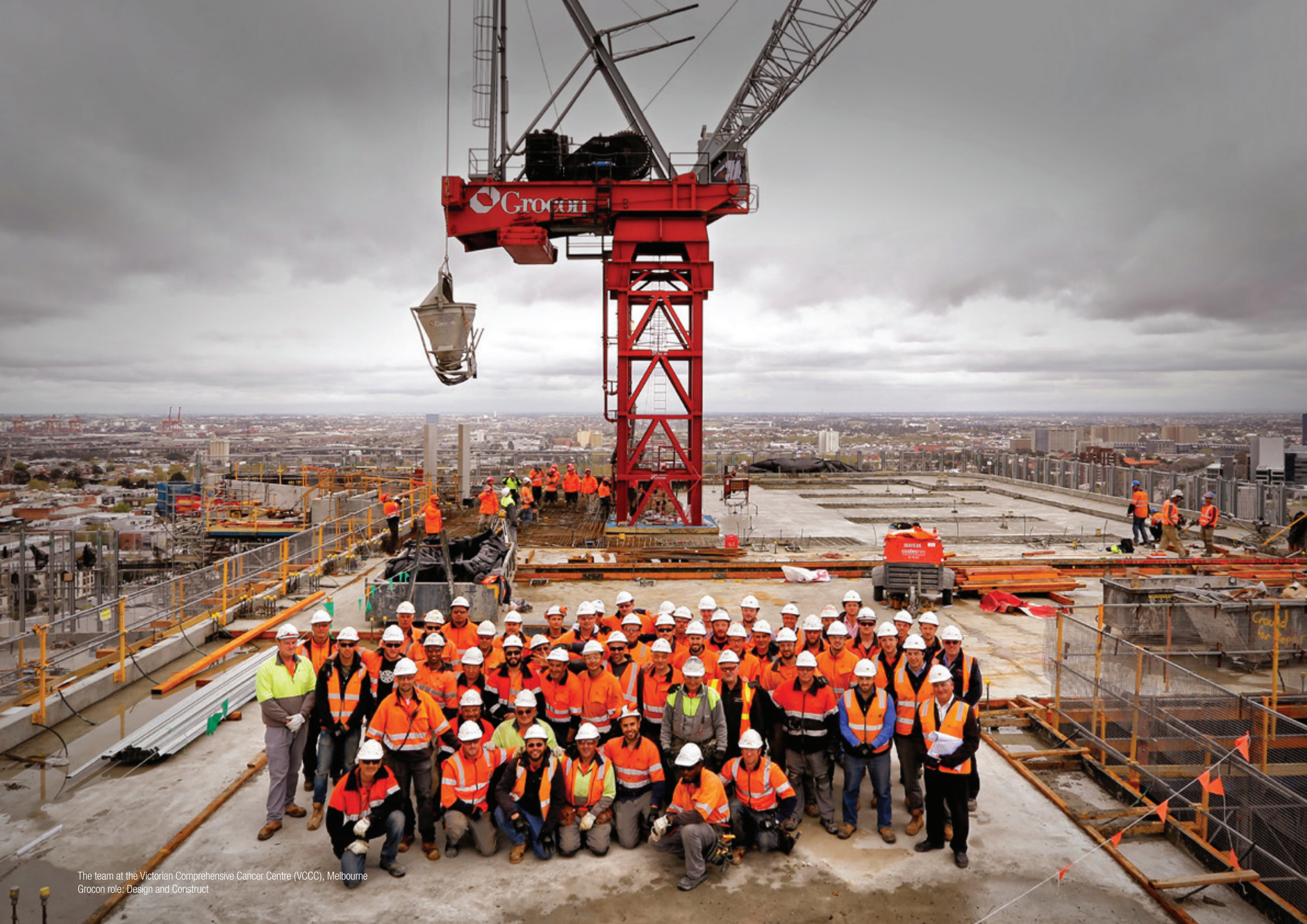
The team at the Victorian Comprehensive Cancer Centre (VCCC), Melbourne Grocon role: Design and Construct