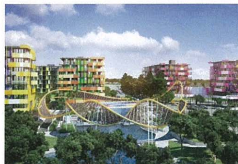
Parklands, Gold Coast