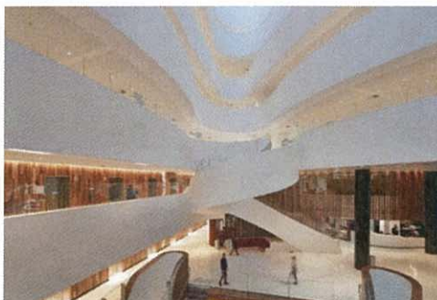
5 Martin Place, Sydney